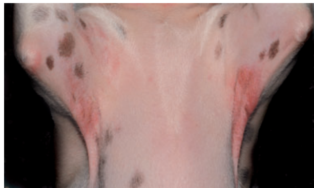
Figure 1. Localized acute flare of canine atopic dermatitis. This dog exhibits patches of erythema and oedema with excoriations on both axillae (example of case scenario 1a).

Case scenario 1b (moderate to severe acute flares). The dog is affected with multifocal patches of oedema, erythema, papules and excoriations on the axillae, groin and medial thighs (Figure 2). He scratches nearly nonstop all over the body.