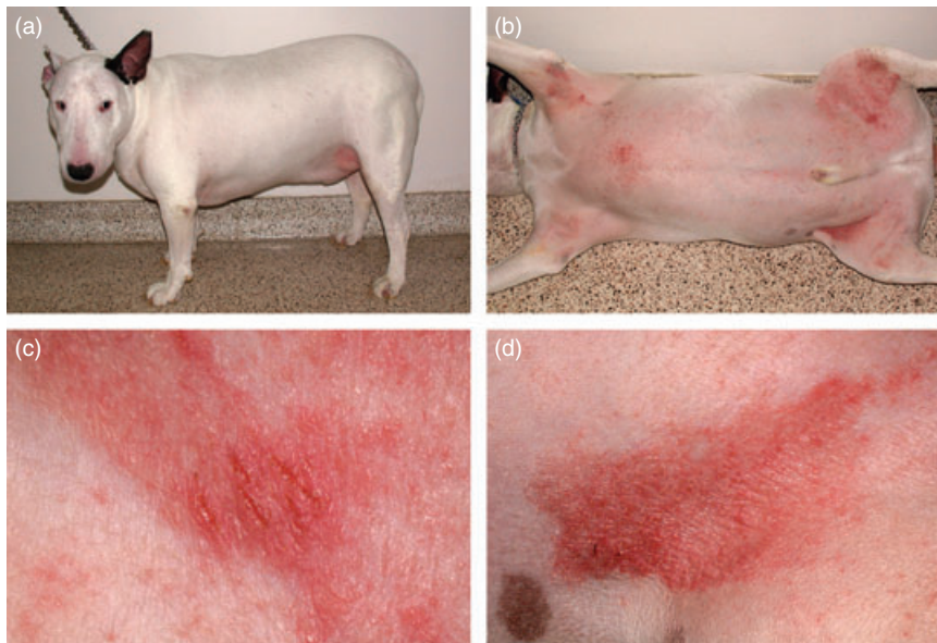
Figure 2. Multifocal to generalized acute flare of canine atopic dermatitis. This dog presents with an acute exacerbation of previous signs of AD. Erythema, oedema, excoriations and papules can be seen on the axillae (b,c), sternum (b), inguinal regions (a,b,d) and medial thighs (example of case scenario 1b).

acid, clindamycin or others) or antifungal drugs (e.g. miconazole, clotrimazole, ketoconazole, terbinafine) are indicated (COE IV). Pet owners should be advised to monitor for signs of worsening of pruritus and skin lesions following topical antiseptic formulations; if this were to happen, a bacterial culture and sensitivity and/or an alternative product should be considered. If lesions of infection are widespread or severe, then systemic antibiotics or antifungal drugs are normally needed (COE IV). Veterinarians should refer to best practice recommendations for oral antimicrobial drug usage in their respective countries (see 'treatment options for chronic canine AD' below for further recommendations on the responsible use of topical and systemic antibiotics).